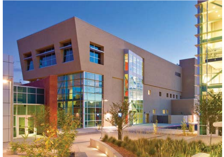
UNMHSC Domenici Center, LEED NC Gold

We have created energy efficient projects for our climate by using common sense approaches to building siting, solar orientation, appropriate use of windows, building mass, and efficient mechanical systems. Our staff has experience with both traditional and innovative sustainable technologies, ranging from passive solar design to underfloor air systems, and from water capture systems to advanced plumbing fixtures. We are pioneering certification approaches on the latest LEED rating systems, and at any given time we are helping at least a dozen of our clients take their projects through the LEED certification process. However, it is the long-term impact of this approach that is most important to us – better buildings, happier people, and a healthier planet.